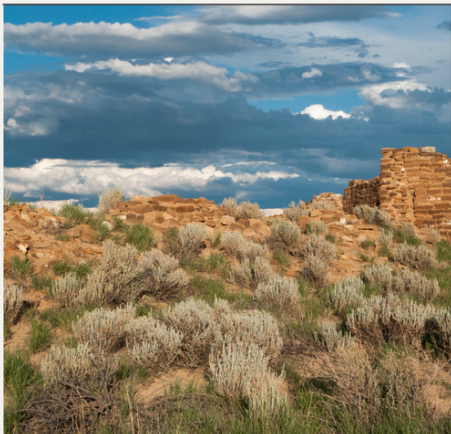
Chaco Landscape Gains Temporary Protection

Save the Dates! Monuments Summer events will take place in Charleston, SC, on 21 July and in San Diego, CA, on 18 August. Detailed information about speakers and registration information will be emailed later this week.