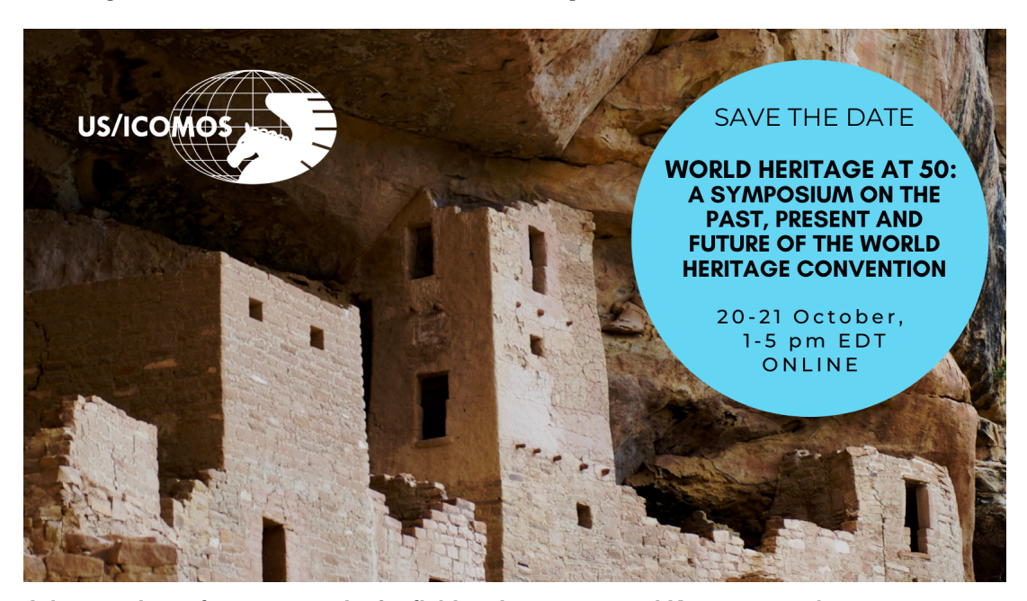
Join us to learn from experts in the field and our esteemed Keynote speakers: