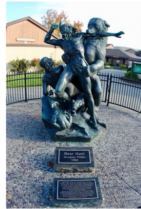
Photo: DaveyNin (2018). Douglas Tilden - Bear Hunt, 1892 . California School for the Deaf, Fremont, California . License: Attribution 2.0 Generic (CC BY 2.0).

https://www.questionpro.com/t/AVCN2ZrqSA