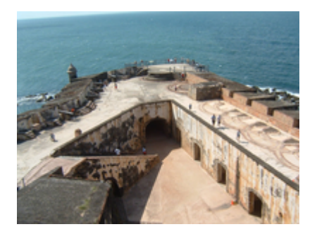
Image: 4th Level at El Morro Fort, <u>NPS San Juan National Historic Site</u>, San Juan, Puerto Rico.

As required by Art. 10 (11) of the ICOMOS Rules of Procedure, following the conclusion of the consultation process and final approval by the ICOMOS Board in May 2021, ICOMOS is sharing the final draft of the ICOMOS Guidelines on Fortifications and Military Heritage, as submitted for adoption. You can download the final draft in English here.