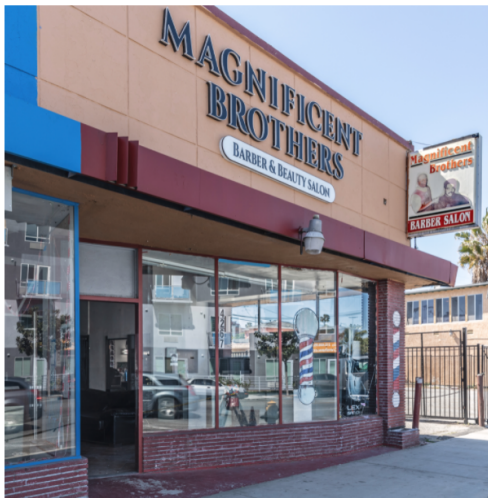
Barber shops such as Magnificent Brothers, in operation in the Crenshaw district since 1970, could be found eligible for listing based on their social significance to the community.

In 2020, the Getty Conservation Institute began a collaborative project with Los Angeles City Planning, Office of Historic Resources to identify, protect, and celebrate the city's Black heritage. The project provides the opportunity to rethink historic preservation policies and processes to better support social justice and equity goals. This work will offer a potential model for future initiatives related to other communities in Los Angeles and beyond.