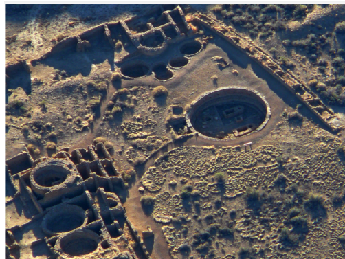
Chaco Culture National Historical Park.

The threat of oil and gas drilling also continues to loom over Chaco Canyon and the Chaco Culture National Historical Park, a World Heritage Site and the ancestral home to both the Pueblo & Navajo peoples. Tribal communities have fought for decades to protect the Greater Chaco Landscape and its cultural resources and safeguard the health of their families from nearby drilling.