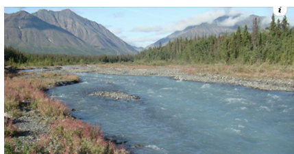
CANADA.ICOMOS.ORG Property and Co-Management | ICOMOS Canada

Please join ICOMOS Canada for a webinar on Indigenous Heritage in collaboration with Indigenous Heritage Circle . Learn more and register here: https://canada.icomos.org/event/property-and-co-management/