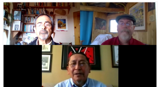
World Heritage Site at Risk: Chaco Culture National Historical Park - Webinar - September 10th, 2020