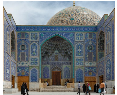
Image: Sheikh Lotfollah Mosque on the Naqsh-e Jahan Square, Isfahan, Iran.

Read the rest of US/ICOMOS's statement here.