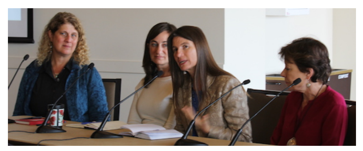
Below: Forward Together concluded with concurrent roundtable discussions. Participants contributed ideas about how to continue the Nature/Culture Journey. A <u>complete agenda for</u> Forward Together and event information can be found on the US/ICOMOS website.