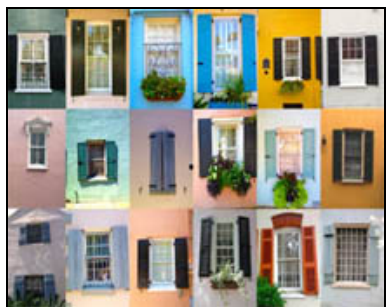
Charleston, South Carolina