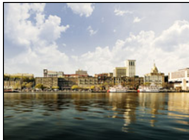
Savannah College of Art & Design, Savannah, Georgia