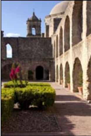
Mission San Jose will be the site of the welcome dinner/40th anniversary celebration of the World Heritage Convention during the 15th US/ICOMOS International Symposium, May 31-June 2, 2012 in San Antonio, Texas