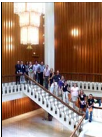
The 2010 class of the US/ICOMOS International Exchange Program at the World Bank in Washington, DC

The conference brings together scholars, site stewards, community researchers, student artists, and enthusiasts from across the nation for five days of renowned speakers, panel discussions, an exhibit hall, and tours of local museums and historic sites. The conference will end with a cultural festival highlighting traditional crafts, language, music and foodways of the Gullah Geechee and Black Seminole whose descendants are invited to attend and share their history and culture.