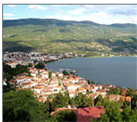
Ohrid and Lake Ohrid, World Heritage Site in Macedonia