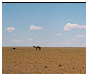
Gobi Desert, Mongolia

This book is not the usual kind of work on architecture or monument preservation. Its aim is to make the case for the preservation of the traditional domestic architecture – buildings often of humble origins – that make up the urban form of Srinagar and the other cities in Kashmir. The work is also unusual in that it makes this case, not in spite of the antiquated construction of these buildings, but because of it. It is framed on the capacity of the best examples of Kashmiri traditional construction to resist one of Nature's most prodigious forces – earthquakes.