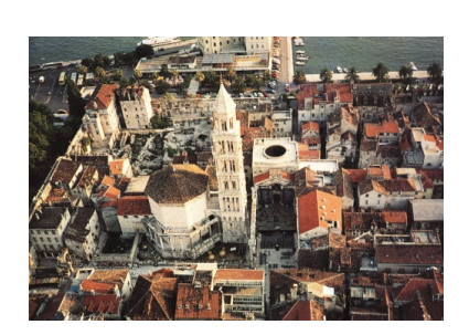
Diocletian's Palace, Croatia