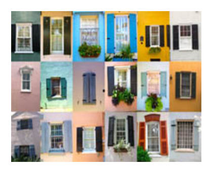
Charleston, South Carolina