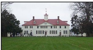
Mount Vernon, Virginia is being nominated to the World Heritage List

that brings together in a unified program a common concern for both man's natural heritage and his cultural heritage."