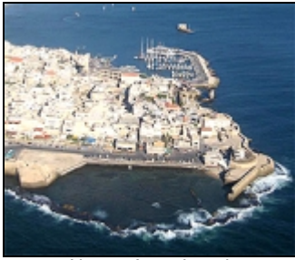
Above: Acre, Israel, World Heritage Site Below: James Cocks,