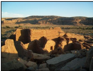
Chaco Culture World Heritage Site in New Mexico