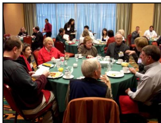
US/ICOMOS International Breakfast, National Preservation Conference, October 16, 2009 Nashville, Tennessee