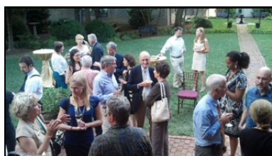
Guests at the 2013 annual reception for the US/ICOMOS International Exchange Program held in the garden of the Heurich House