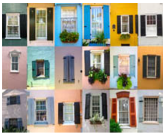
Charleston, South Carolina