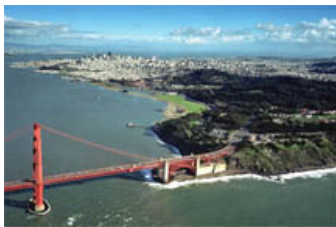
The Presidio, San Francisco, California