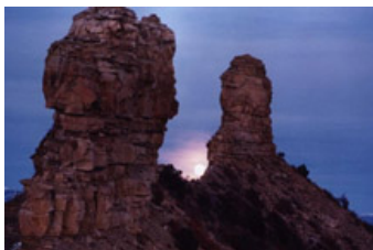
Chimney Rock National Monument, Colorado