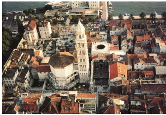
Diocletian's Palace, Croatia

More information on the conference and submission requirements is at: http://www.edra.org/edra44providence . The submission deadline is September 21.