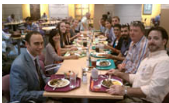
Lunch at the World Bank Cafeteria