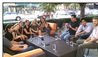
Relaxing start to their final evening in Washington at Bar Dupont

CONGRATULATIONS TO THE 2010 CLASS OF THE US/ICOMOS INTERNATIONAL EXCHANGE PROGRAM!