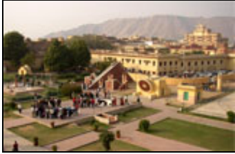
The Jantar Mantar, Jaipur (India)