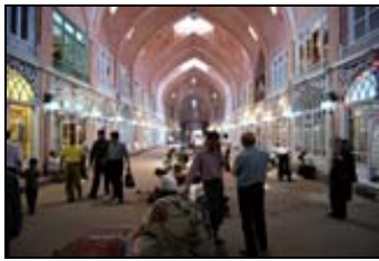
Tabriz Historic Bazaar Complex (Iran)