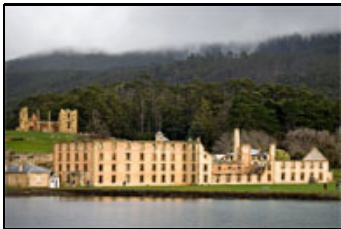
Convict Sites (Australia)