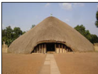
Tombs of Buganda Kings (Uganda)