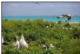
Papahānaumokuākea (United States) - mixed natural and cultural site

In 2005, the National Trust for Historic Preservation named Finca Vigía to its list of 11 Most Endangered Historic Places. Built in 1886 on a hillside near Havana, Finca Vigía or "Lookout Farm" was Ernest Hemingway's home from 1939 to 1960, the period when he wrote For Whom the Bell Tolls , The Old Man and The Sea and the posthumously-published A Moveable Feast and Islands in the Stream . The house has long-chronicled Hemingway's life. The National Trust and the Hemingway Preservation Foundation (now the Finca Vigía Foundation) subsequently assembled a team of architects and engineers to work with their Cuban counterparts to prepare an emergency stabilization and preservation plan for the property. America's 11 Most Endangered Historic Places has identified more than 200 one-of-a-kind historic treasures since 1988. From urban districts to rural landscapes, Native American landmarks to 20th-century sports arenas, entire communities to single buildings, the list spotlights places across America that are threatened by neglect, insufficient funds, inappropriate development, or insensitive public policy.