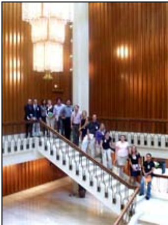
Touring the The World Bank headquarters building