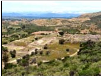
Prehistoric Caves of Yagul and Mitla in the Central Valley of Oaxaca (Mexico)