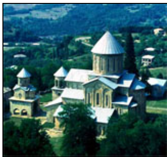
Bagrati Cathedral and Gelati Monastery (Georgia)