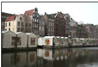
17th Century canal ring area of Amsterdam inside the Singelgracht (Netherlands)