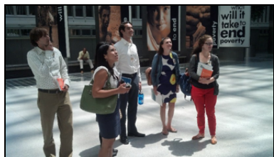
US/ICOMOS interns in the atrium of the World Bank Headquarters

Preservation Action Lobbies Congress on UNESCO Funding