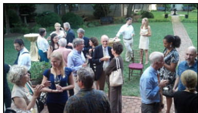
Guests at the reception in the garden of the Heurich House