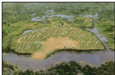
Poverty Point, Louisiana

Cahokia Mounds Welcomes 10 Millionth Visitor