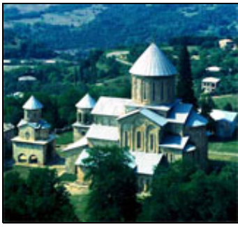
Bagrati Cathedral and Gelati Monastery (Georgia)