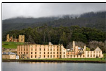
Convict Sites (Australia)