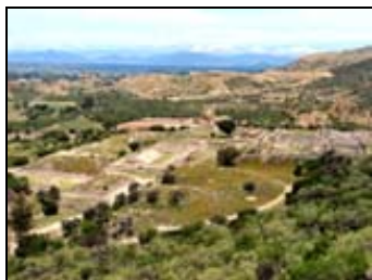
Prehistoric Caves of Yagul and Mitla in the Central Valley of Oaxaca (Mexico)