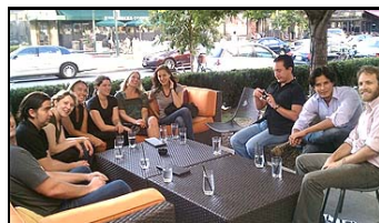
Relaxing start to their final evening in Washington at Bar Dupont

CONGRATULATIONS TO THE 2010 CLASS OF THE US/ICOMOS INTERNATIONAL