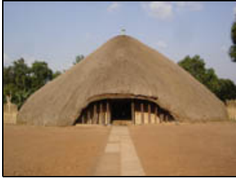
Tombs of Buganda Kings (Uganda)