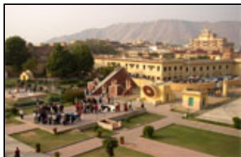
The Jantar Mantar, Jaipur (India)