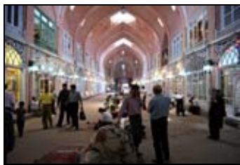
Tabriz Historic Bazaar Complex (Iran)