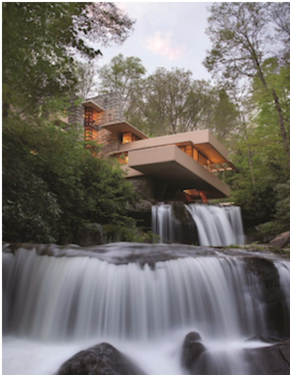
Image: Fallingwater in Mill Run, Pennsylvania.

Designation marks the U.S.’s first works of modern architecture on the World Heritage List