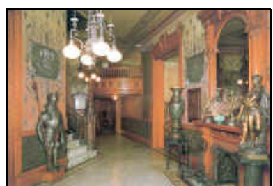
First floor of the Heurich House

19 New Sites Inscribed on the World Heritage List