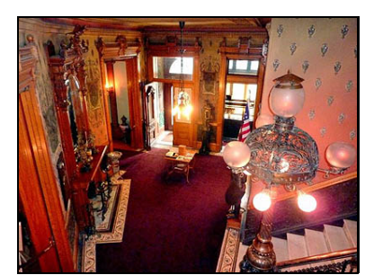
First floor of the Heurich House

1307 New Hampshire Avenue, NW Washington, DC 20036