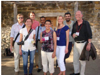
US/ICOMOS International Exchange Program participants at the US/ICOMOS Symposium in San Antonio, Texas

http://www.preservationnation.org/resources/training/npc/2012-spokane/registration-housing.html