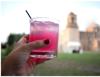
Mission San Jose was the site of the welcome dinner/40th anniversary celebration of the World Heritage Convention during the 15th US/ICOMOS International Symposium, May 31-June 2, 2012 in San Antonio, Texas