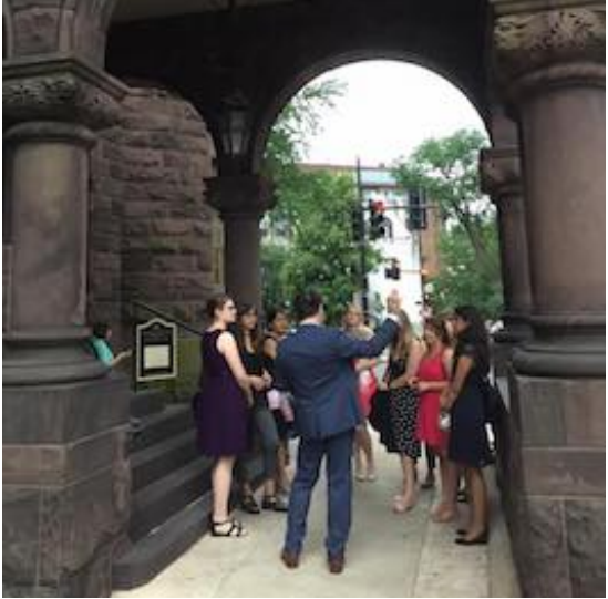
Above left: Participants tour Dumbarton Oaks Gardens on the third day of their orientation and, above right, the Heurich House Museum.