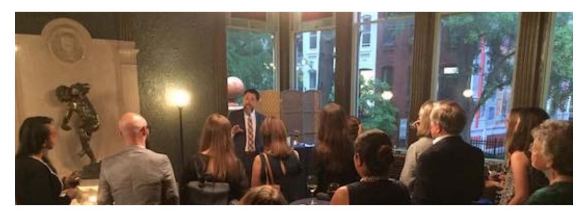
Above: IEP orientation always concludes with a Welcome Reception giving participants a chance to meet US/ICOMOS members and supporters. This year, IEP orientation coincided with a meeting of