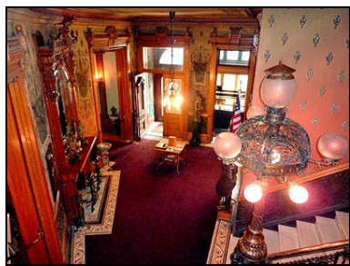
First floor of the Heurich House