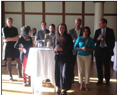
Guests at the reception