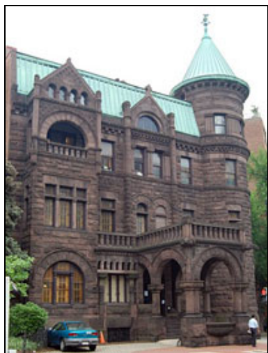
Heurich House (Brewmaster's Castle) - the new home of US/ICOMOS on September 1, 2013