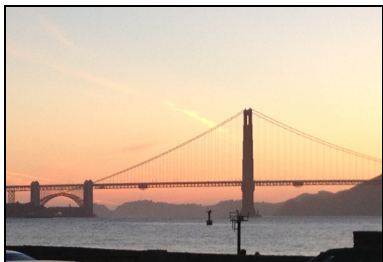
Golden Gate Bridge from the Saint Francis Yacht Club