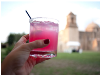
Mission San Jose was the site of the welcome dinner/40th anniversary celebration of the World Heritage Convention during the 15th US/ICOMOS International Symposium, May 31-June 2, 2012 in San Antonio, Texas