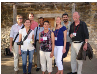
US/ICOMOS International Exchange Program participants at the US/ICOMOS Symposium in San Antonio, Texas

http://www.nbm.org/programs-lectures/programs/2012-programs/july-2012/quilt-in-the-capital-2012.html