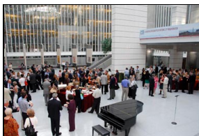
Welcome Reception in the Atrium of The World Bank Headquarters