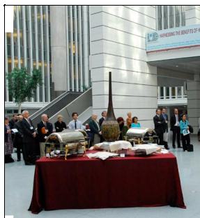
Buffet at the Welcome Reception