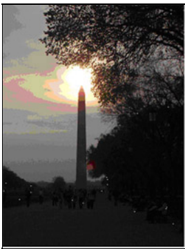
The US/ICOMOS Secretariat is located in Washington, DC