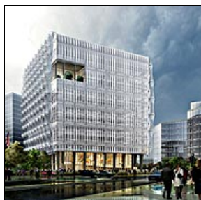
New US Embassy being planned for London (Photo credit: KieranTimberlake/ Studio amd)