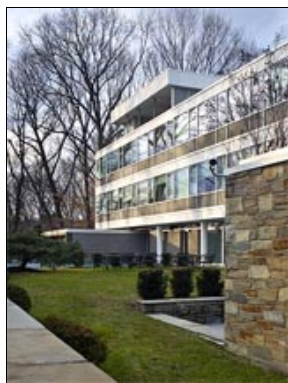
Embassy of Denmark in Washington, DC