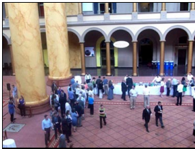
Coffee break during "The Architecture of Diplomacy" Symposium at the National Building Museum