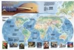
Order the 2009-2010 World Heritage Map