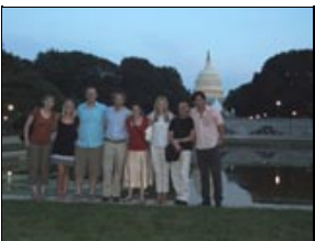
On the National Mall at night