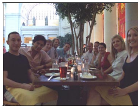
Welcome Dinner at Thunder Grill in Union Station