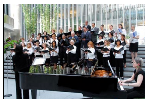
Performance by the World Bank-IMF Chorus