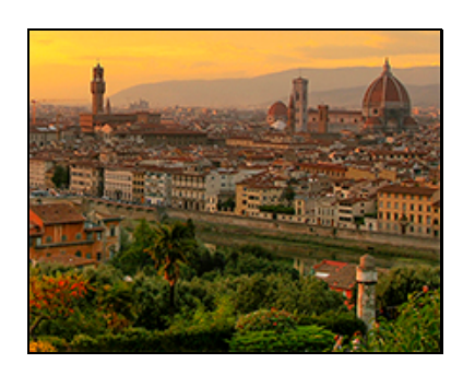
Florence, Italy, site of the 18th ICOMOS General Assembly

The 2014 US/ICOMOS International Symposium was held April 3-5, 2014 in Philadelphia, Pennsylvania. Nearly 100 filled the lower gallery of Meyerson Hall on the campus of the University of Pennsylvania to hear presentations on the 50th anniversary of the Venice Charter and its legacy. US/ICOMOS was delighted to have assembled such a distinguished group of scholars from around the world to reflect on a variety of aspects of the Venice Charter, from its applicability in India to contemporary issues of place making and how the charter fits with these ideas.