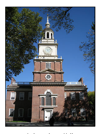
Independence Hall World Heritage Site in Philadelphia