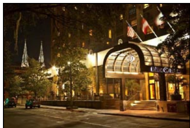
Hotel Savannah Desoto