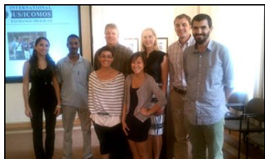
The 2012 class of US/ICOMOS International Interns in Washington, DC