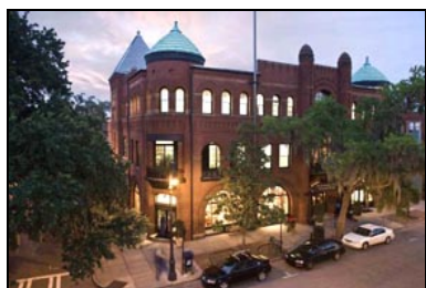
SCAD's Poetter Hall

SCAD Museum of Art http://www.scadmoa.org/