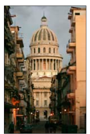
Old Havana, Cuba

Workshop on "Greening Real Estate Markets" to be held in Dessau, Germany on 26 and 27 April 2010. To obtain more information, please click on the following link: <a href="http://www.unece.org/hlm/wpla/workshops/call.4.presentations.dessau.pdf">http://www.unece.org/hlm/wpla/workshops/call.4.presentations.dessau.pdf</a>