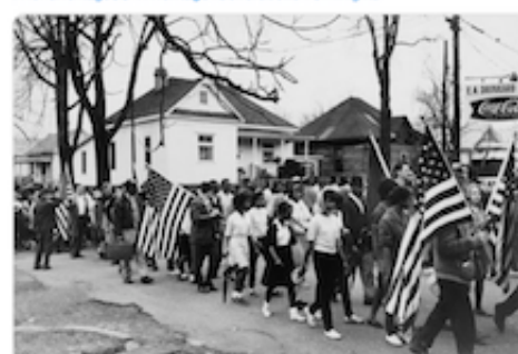
Selma to Montgomery March, 1965

US/ICOMOS @usicomos · 12 May 2018 Do you know how #WorldHeritage site identification and nomination works? This document regarding US Civil Rights Sites provides a concise overview: bit.ly/2G63zwg . Many people are working on this important effort! #WorldHeritageUSA #Heritage4Generations #CivilRights