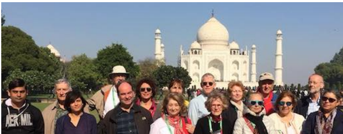
Above: ICOFORT committee members visited the Taj Mahal after attending the ICOMOS 19th