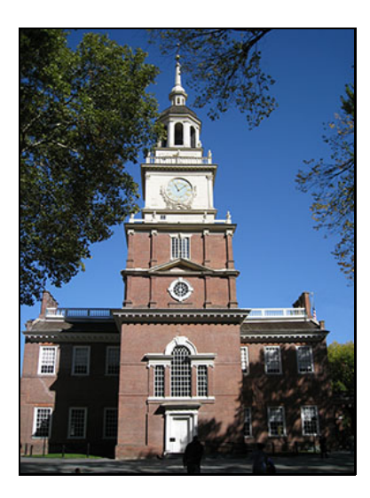
Independence Hall World Heritage Site in Philadelphia