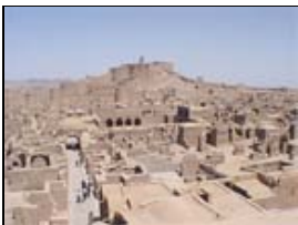
Bam, Iran (by Benutzer)