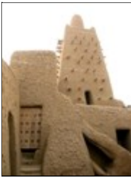
Timbuktu, Mali