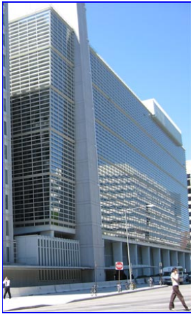
The World Bank Headquarters in Washington, DC