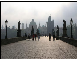
Prague, Czech Republic