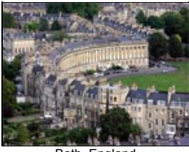
Bath, England (by Arpingstone)