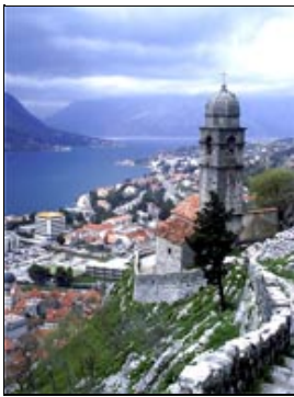
Kotor, Montenegro