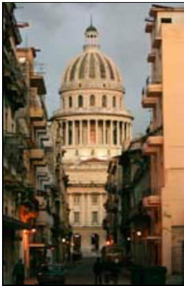
Old Havana, Cuba