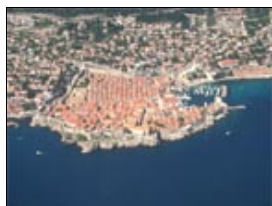
Dubrovnik, Croatia