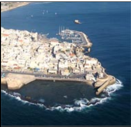
Acre, Israel (public domain)

Organization of World Heritage Cities http://www.ovpm.org/?newlang=eng