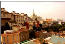
Valparaiso, Chile