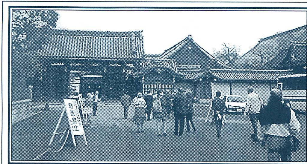
Myoshin-Ji This Buddhist Temple in Kyoto is rebuilt periodically