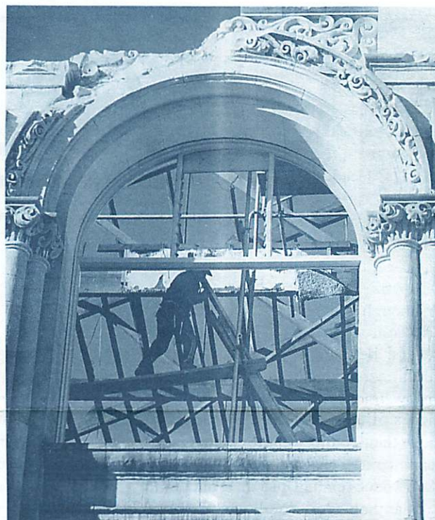
Kaiapoi Woollen Mill

The cost of appeal has therefore prevented the Trust from acting on countless archaeological sites. Its critics say, it has