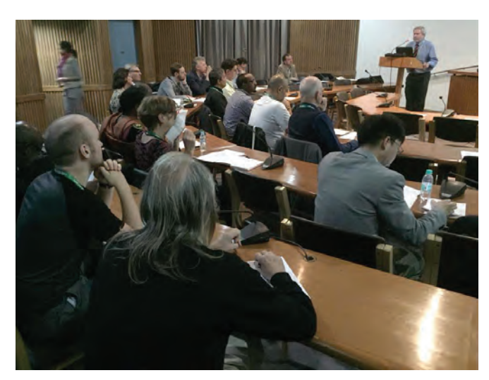
US/ICOMOS Chair Doug Comer leads a meeting on the Africa Initiative with representatives of nearly 20 ICOMOS national committees during the 2017 Triennial General Assembly in Delhi.