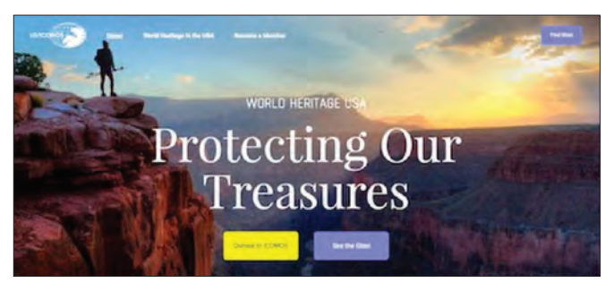
The landing page for www.worldheritageusa.org.

their cultural heritage and to value its diversity, vulnerability and the efforts required to protect and conserve it.