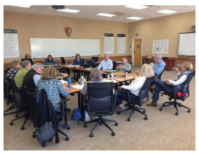
The US/ICOMOS Board meeting with park managers, friends and stewards of Chaco Culture and Grand Canyon National Parks.

National and world heritage leaders met in Washington, DC, at the US Department of the Interior headquarters for the <u>US/ICOMOS 2017 Leadership Forum</u>. The primary goals of the convening were to refine the strategic path and priorities for US/ICOMOS in 2018 and beyond, and to provide a clearer picture of the US role in world heritage in this time of global transition. More than 120 heritage professionals attended, and participated in frank, challenging, constructive and cordial plenary and breakout sessions addressing the state of international heritage programs in the US; KnowledgeExchange thematic areas; select US/ICOMOS programs; and how to better serve our members and achieve US/ICOMOS's mission. A draft resolution on the engagement of the US in the World Heritage Program resulted from the closing plenary, in light of the announced withdrawal of the US from UNESCO at the end of 2018. The findings of the Leadership Forum and proposed next steps will be reviewed by the Board of Trustees in January 2018 and acted upon early in the new year.