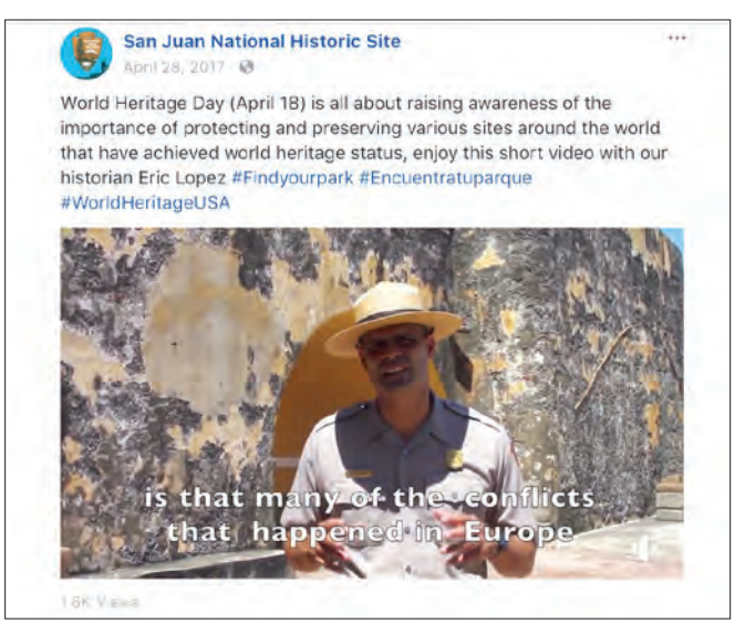
San Juan National Historic Site, inscribed in the World Heritage List in 1983, is a very creative partner of US/ICOMOS and was heavily impacted by Hurricane Maria.

Localizing implementation, by providing guidance and direction to stakeholders to adopt tools of implementation