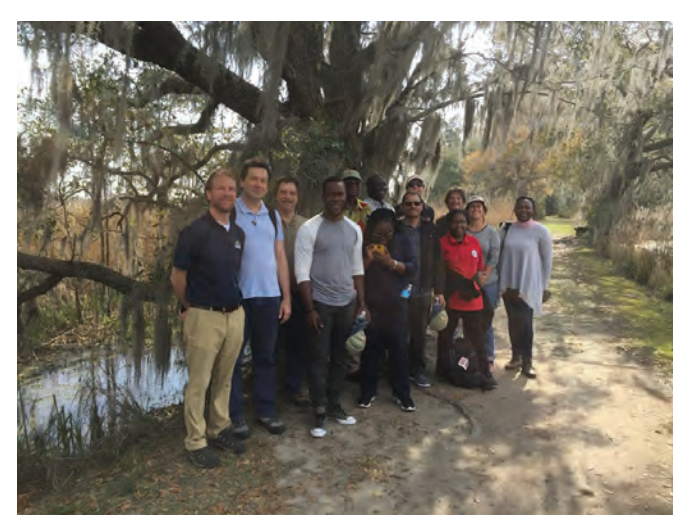
The conferees at the Charleston County Caw Caw Interpretive Center.

Around the conference table and onsite within GRCA there was frank discussion between US/ICOMOS representatives and park management, tribal groups and