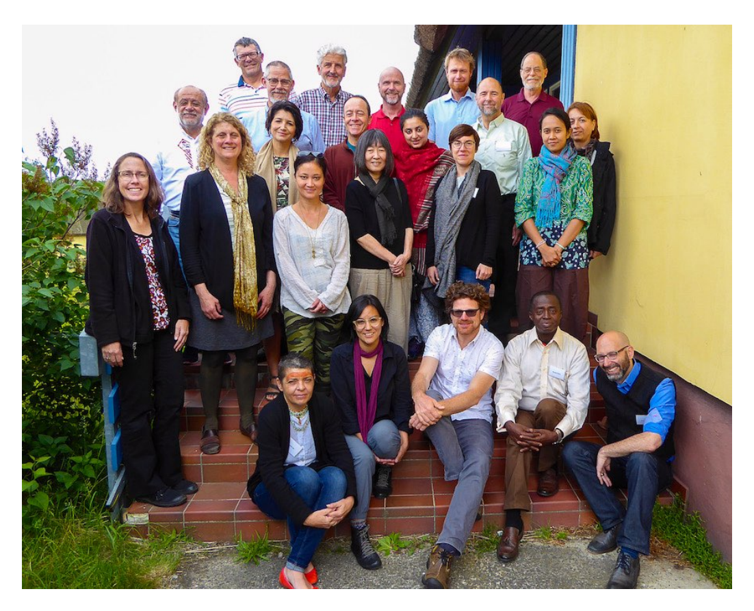
Figure 3. Participants at the second Vilm workshop, 2017.

Building on the earlier work of the CSVPA and its affiliates, the Best Practice Guidelines broadens the reach and scope of protected and conserved area management and governance to include the cultural and spiritual significance that nature in general has for Indigenous traditions and communities, mainstream religions, and environmental organizations representing the general public. The first part of the volume explains the meaning of the key phrase "cultural and spiritual significance of nature" and the shift from "values" to "significance" as follows: