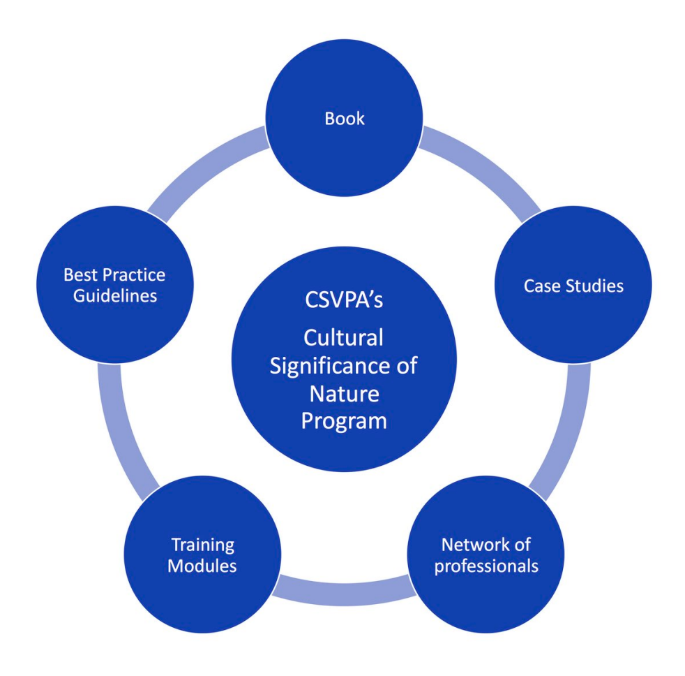
Figure 2. Diagram of the five core components of the CSVPA's program on the cultural and spiritual significance of nature.