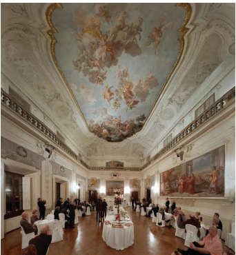
General Assembly proceedings (Left); US/ICOMOS Gala Reception at the Palazzo Capponi all'Annunziata (Right).

Early November brought the much awaited 18th ICO-MOS General Assembly and International Symposium. Over 50 Americans made the trip to Florence, Italy for this triennial international gathering of nearly 2,000 heritage experts. General Assembly highlights for the U.S. delegation included major contributions to a resolution addressing the place of culture and heritage in the United Nations